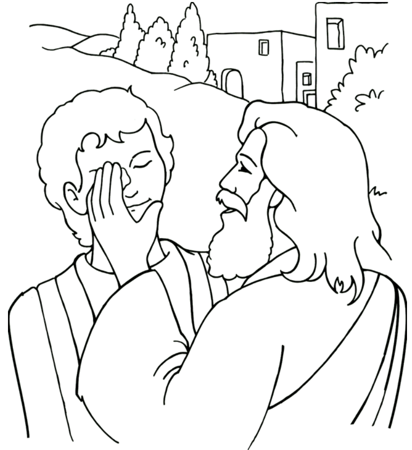
Jesus heals a blind man. John 9

From Thru-the-Bible Coloring Pages for Ages 4-8. © 1986,1988 Standard Publishing. Used by permission. Reproducible Coloring Books may be purchased from Standard Publishing, www.standardpub.com , 1-800-543-1301.